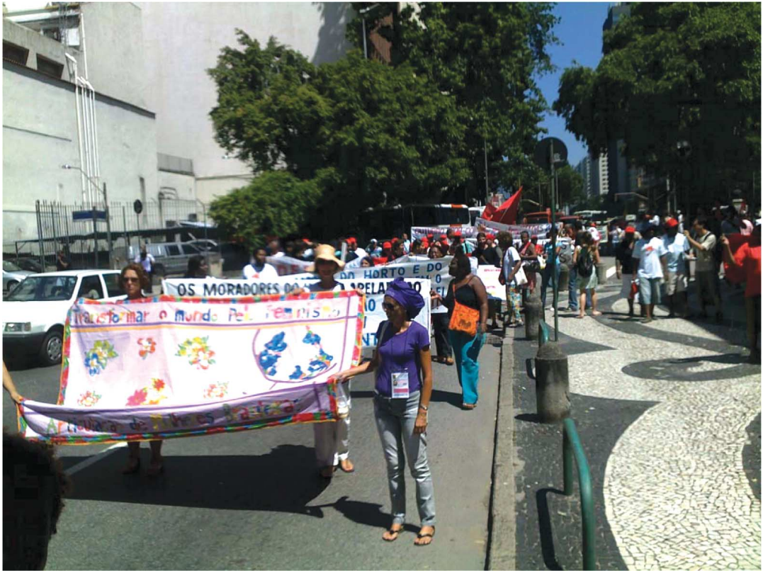
Figure 1 22 March 2010: the participants of the Fórum Social Urbano (Social Urban Forum, SUF) take part in a march to protest against what was perceived as a somewhat exclusionary space, the World Urban Forum (WUF).

without showing solidarity (probably on the contrary). Finally the protesters decided to go to the SUF's venue, provocatively located only c.300 metres away from the WUF's venue, in Rio de Janeiro's harbour area.