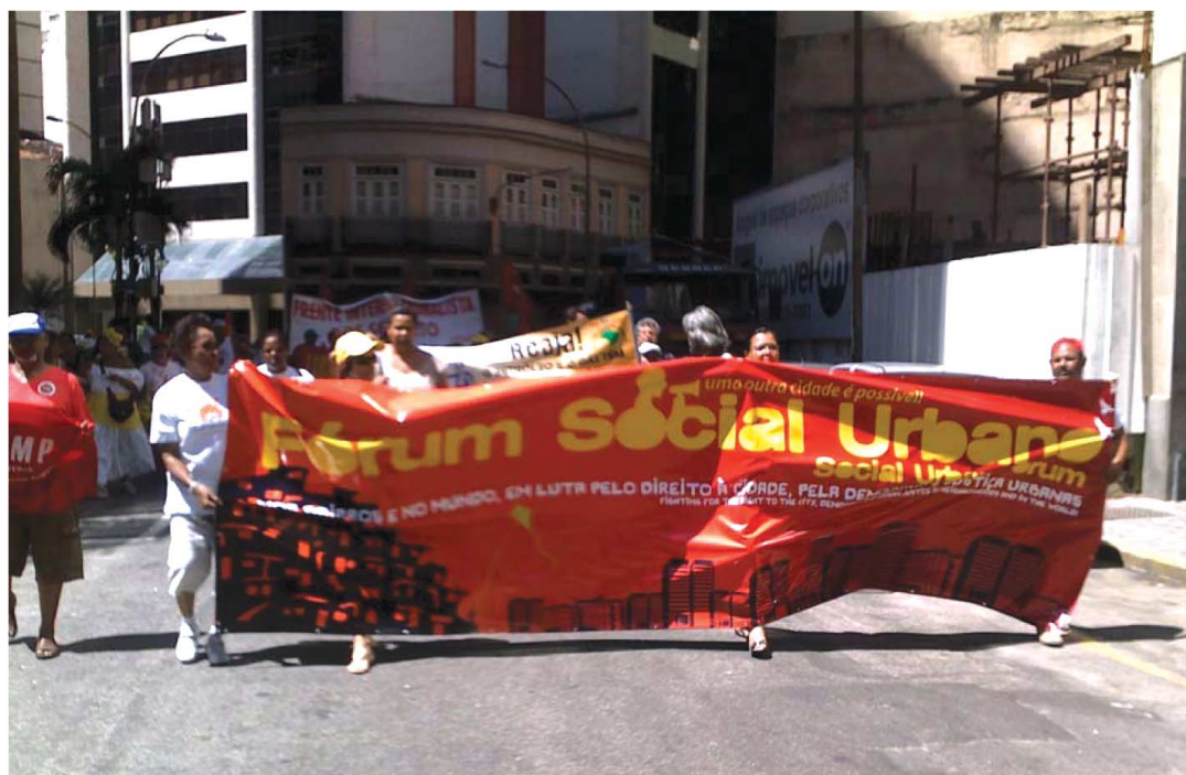
Figure 2 The protest march goes on through Rio de Janeiro's Central Business District.

ing—(almost) from the beginning. ‘Too much government (and consultants and academics) + NGOs (and almost no social movements in a proper sense)’ was a usual criticism on the part of activists. Actually I was not ‘frustrated’ myself, simply because I did not have any great expectations at all. But I must confess I was quite frustrated by the Social Urban Forum . When it came to an end on Friday, 26 March, my (relative) enthusiasm had been replaced with disappointment.