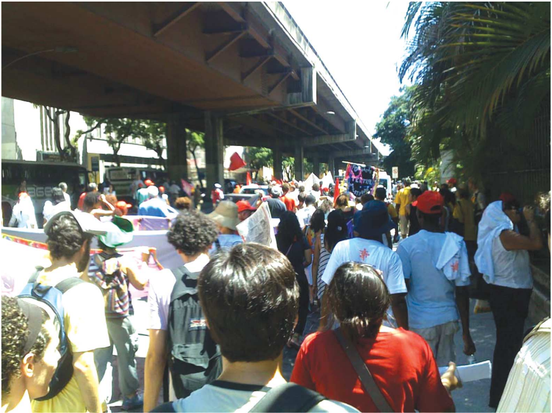
Figure 3 The march reaches Rio's harbour area, where the World Urban Forum's venue was located.

with some political parties and/or with some big NGOs as well. They form a kind of network which only at first glance appears to be a true alternative to institutions such as HABITAT and governments (but in fact, many or most of them are or were also more or less connected with institutions like these, despite some appearances to the contrary).