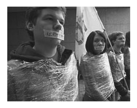
Figure 5. "No comment" protests of students in Vienna 2009 © #unibrennt.