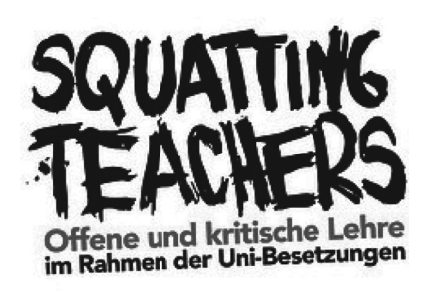
Figure 2. Squatting teachers' flyer © Squatting teachers Vienna.

A central conclusion drawn from the considerations set out above is that resistance is necessary in order to work on and change one's own practical sense. Thus, resistant learning directed at challenging and changing one's own practical sense is needed. This includes two essential aspects.