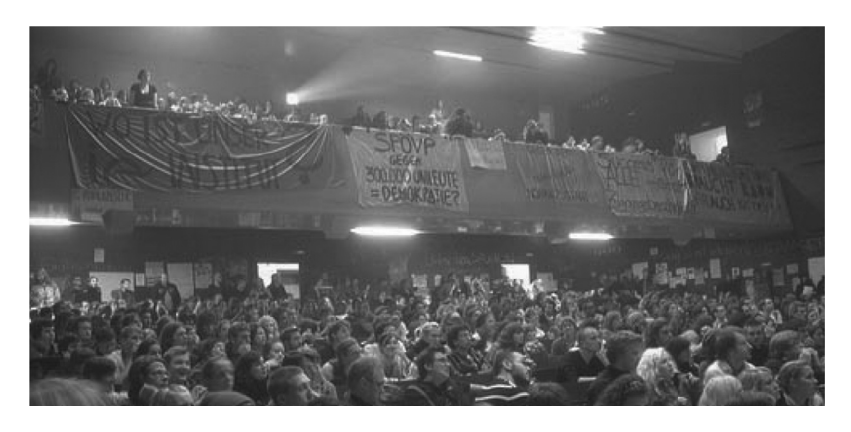
Figure 3. Daily plenum, in the main auditorium of the University of Vienna

encountered several limitations and challenges the protesters had to take on and deal with, which was an important learning experience itself. Thereby they adapted and developed their practice further and had to constantly reflect on it. Another example of action learning in the protest movements were the so-called 'Volkküchen' (derived from the German word "Volksküchen", which literally means "people's kitchens") that were established rather fast and maintained by volunteers cooking donated food and provided meals for free in return for a voluntary donation. For certain people involved in the protest this was a new experience of handling food and enabled them to experience other forms of supplying goods beyond capitalism. The establishment of the 'Collective Kindergarten Rebellion' can be interpreted as an attempt to develop a distinct practice of networking and of defending one's interests as a base, since they aimed at providing themselves with the opportunity of exchange, reflection, articulation of concerns, discussion and of political decision-making processes that went beyond those of the usual, hierarchical interest groups and trade union structures (Collective Kindergarten Rebellion 2011, p. 7).