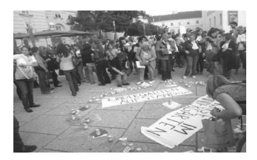
Figure 4. Flash mob of kindergarten teachers in Vienna 2009

From the conclusion that a practice of resistance first has to be developed and learned emerge several tasks for critical education-like fighting for, providing and maintaining autonomous space for reflection and learning in which the parties