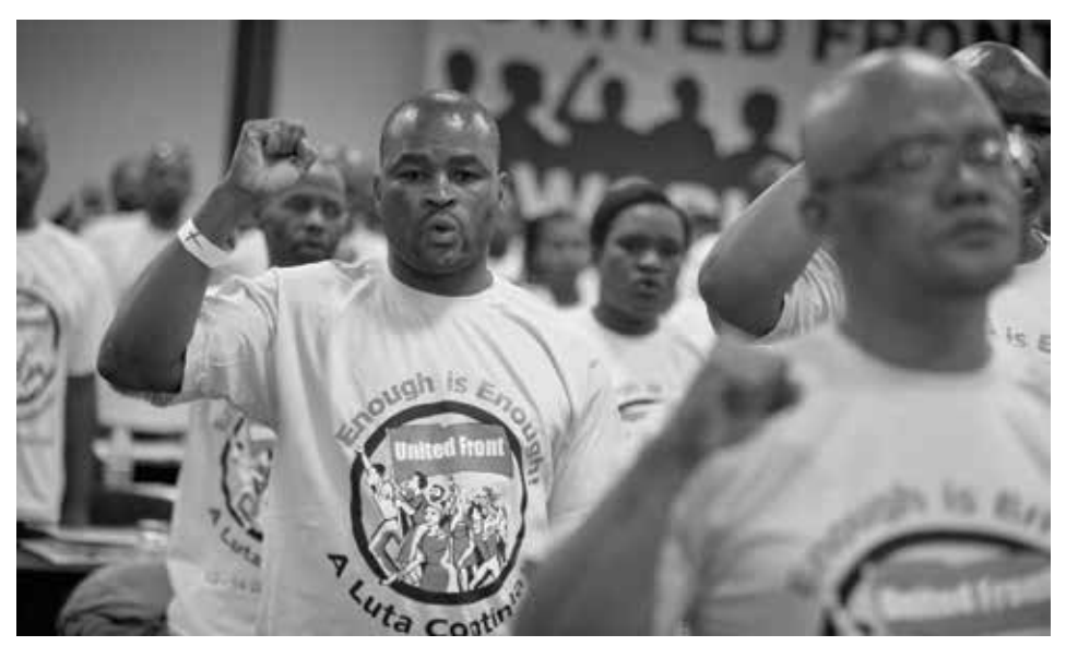
The United Front 'preparatory assembly'.