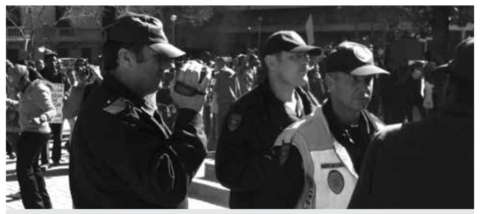
Police taking video at a protest against hate crimes in Johannesburg, 2011.