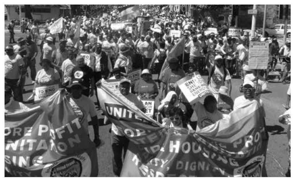
United Front march on Budget Day.