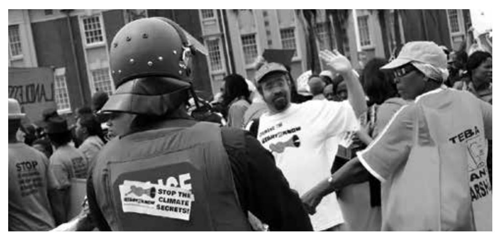
Riot police at the climate justice march in Durban during COP17, 2011