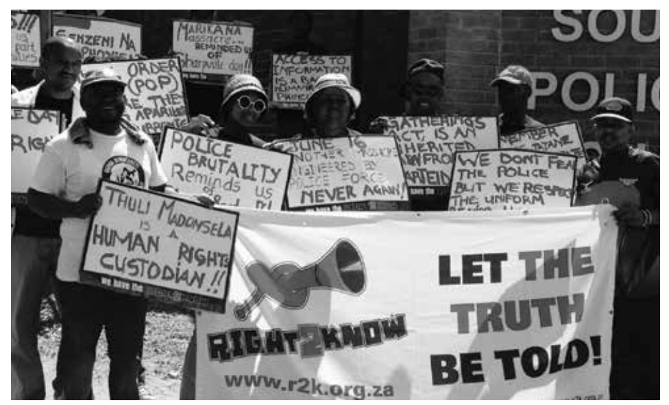
Right2Know KZN picket of Chatsworth police station, 2015.