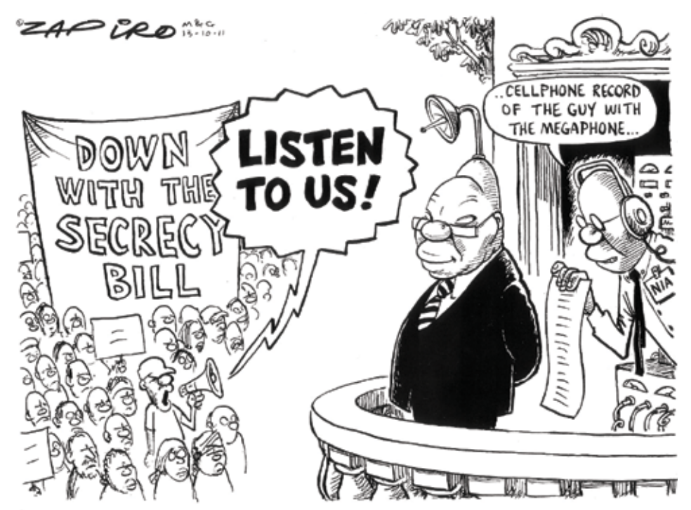
© 2011 Zapiro, Mail & Guardian - Reprinted with permission - For more Zapiro cartoons visit www.zapiro.com