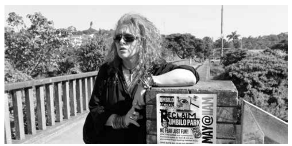
Vanessa Burger.