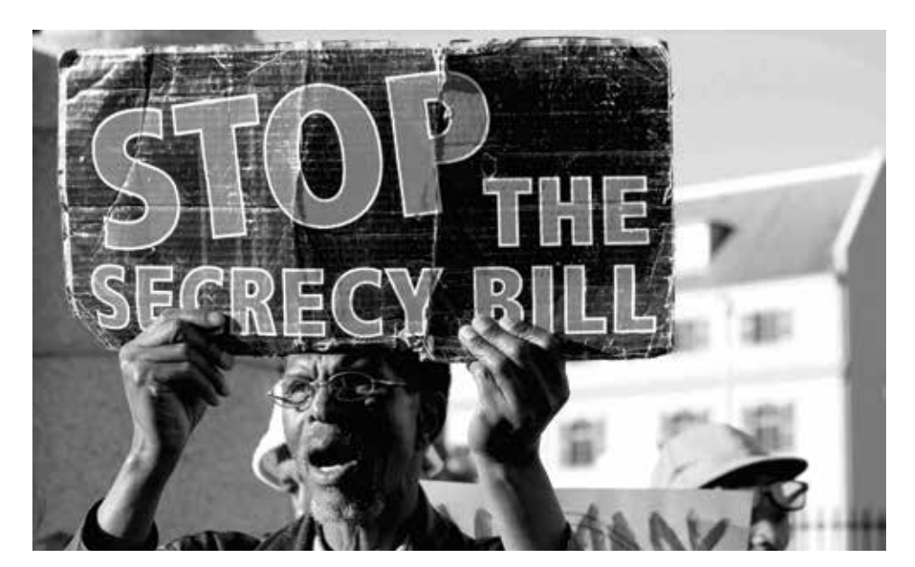
R2K camp-out at the gates of Parliament, 2012.