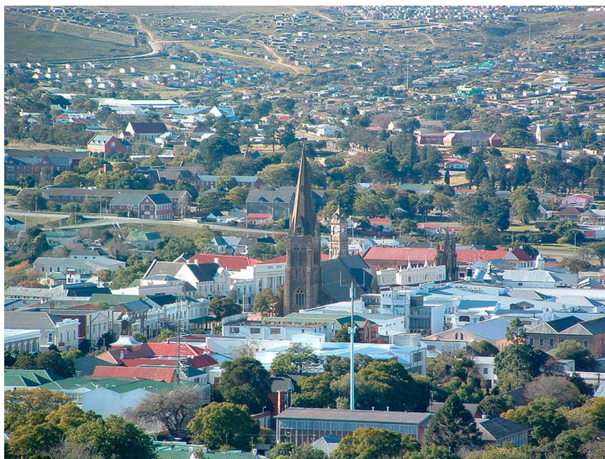
View of Grahamstown from Fort Selwyn – clearly showing a town divided.