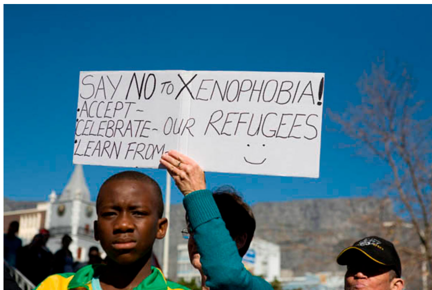
Anti-xenophobia walk held in Cape Town on Mandela Day, 2010.

Fiela, initially meant to be a response to xenophobic attacks (Nicolson, 2015). The South African Government (n.d.) website describes it as follows: