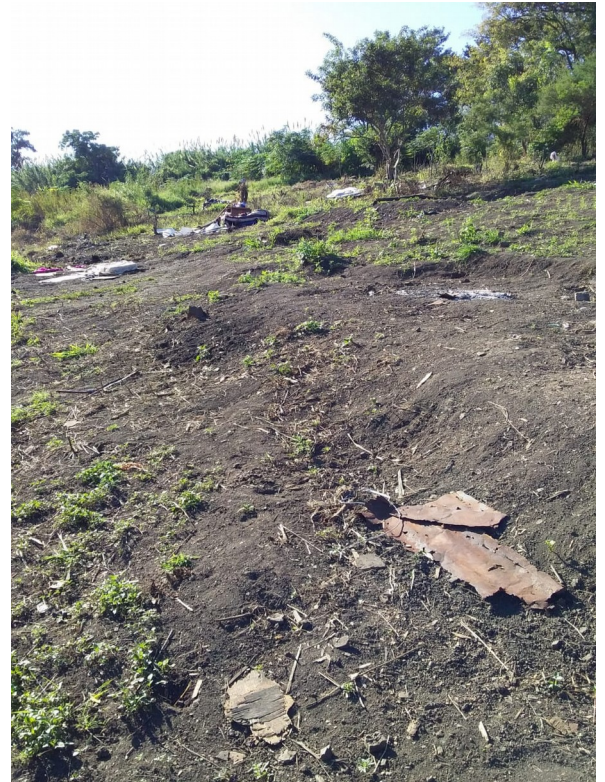
Illustration 9: the aftermath