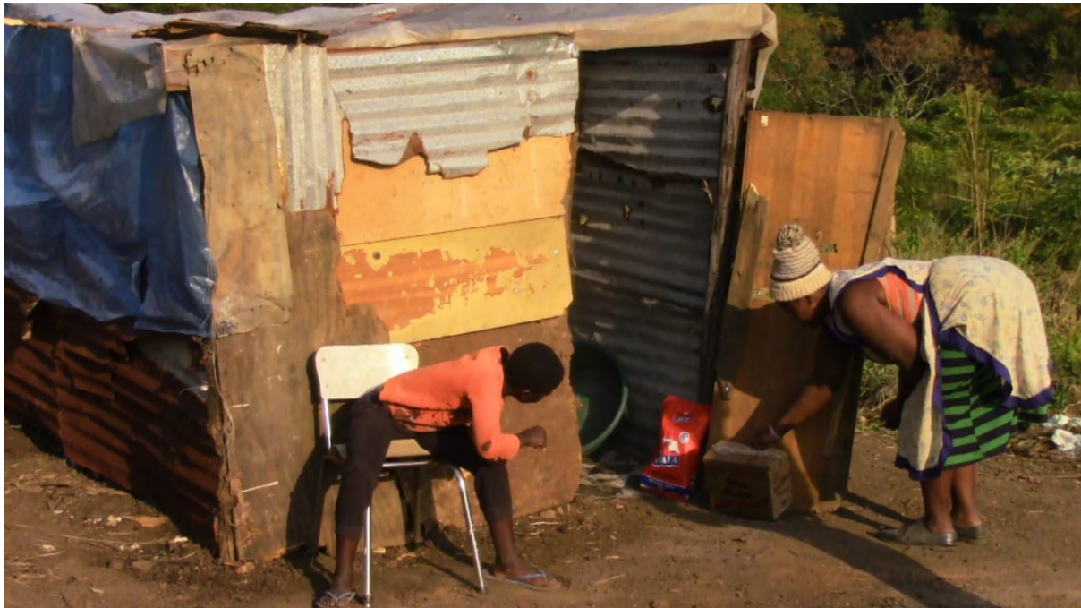
Illustration 2: Domestic life and work at Azania

The United Nations Habitat also urges all levels of government to take immediate and drastic measures to secure adequate housing for all citizens and provide for the basic needs of vulnerable communities including food, water, sanitation and hygiene essentials and healthcare.