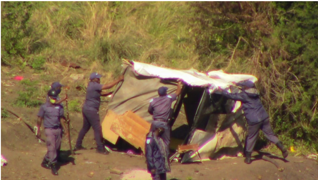
Illustration 4: Home being demolished at Azania settlement

interdict that says people must not continue building because it's a settlement that's already there. So people were taking advantage," Luthuli commented.