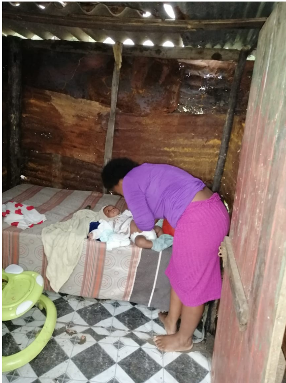
Illustration 1: mother and child in their home at Azania settlement before eviction.

This is just one example. Since the lockdown began, there have been a total of 18 illegal evictions in Azania, eKhenana and Ekuphumeleleni settlements over a period of two months. Approximately 900 people have been affected including multiple physical injuries including wounds from live ammunition, pellet guns and panga attacks.