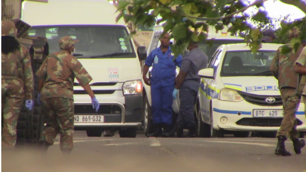
Illustration 3: Municipal security, police, and army forces gather to attack Azania