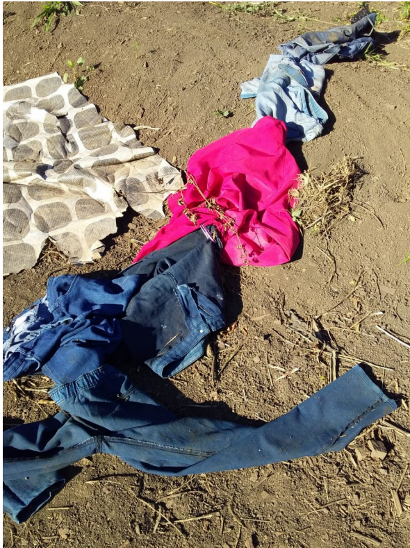
Illustration 8: the aftermath

Gaede concludes that these evictions occurring during a pandemic are unjustifiable from the human rights health perspective on a personal, social and public health level.